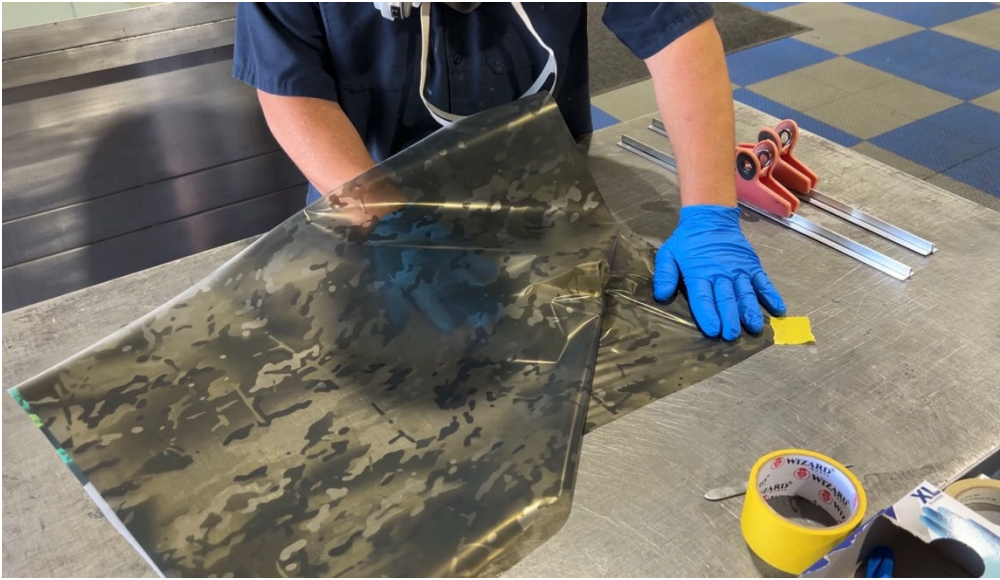
Image 1 How to Peel Clear Backing from Film